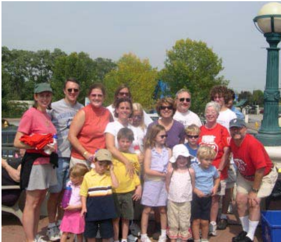
The happy walkers from St. John's who participated in the Hunger Hike in September