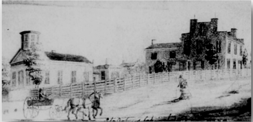
The original church building (built in 1838) and rectory (built in 1844).

Worshipping · Sharing · Making Christ Known