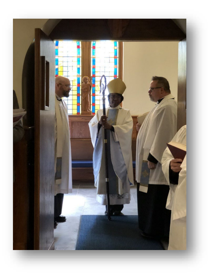
We love because God first loved us.... The commandment we have from him is this: those who love God must love their brothers and sisters also. -1 John 4.19, 21

barbecue and ice cream sundaes afterwards. We plan to continue holding Morning Prayer via Zoom together most Sundays to expand our reach and welcome those who are unable to be in-person.