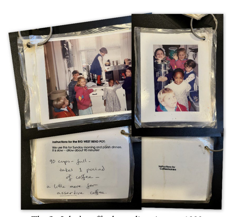
The St. John's coffee hour directions, c. 1990.