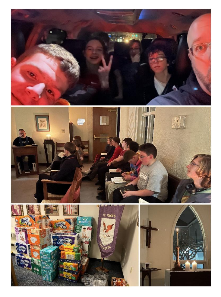
The Greater Lafayette Episcopal Youth Group held a lock-in in early December. In addition to shopping for Jubilee Christmas (we purchased over 85,000 sheets of toilet paper!), we played games and worshipped late into the night!